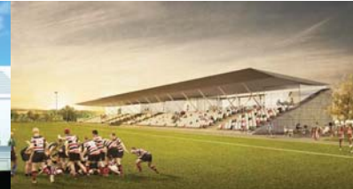
Berliner Rugby Club Stadium 25,800m² gross floor area, 1,340m² building area. Completion 2016.