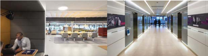
Vopak, Rotterdam Hollandse Nieuwe