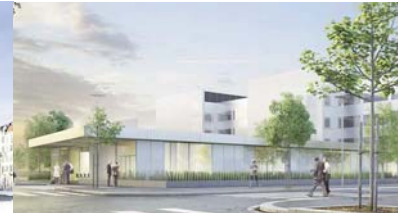
L'Oréal Saint Ouen A restructuring and extension for the R&D campus, providing new services and a conference centre. Completing in September 2015.