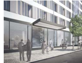
Multi-functional building, Berlin Hotel, apartments and underground parking lots, 16,250m² gross floor area. Completion 2016.