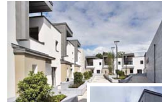
Athlone Town Centre, Residential Quarter

The residential component of this 108,000m² mixed use urban regeneration project incorporates 155 units in a mix of town houses, duplexes and apartments on a 2.9 ha site adjacent to the town's historical quarter. MOLA Architecture have been engaged in adding to and reconfiguring the residential quarter in 2014 to meet new landlord and tenant demands in an evolving, post-recessionary, residential market.