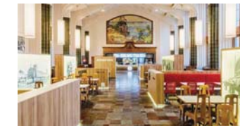
Burger King restaurants in Finland Guidelines made it possible for the restaurant to be implemented in a unique space by the architect Eliel Saarinen's, a Jugend style Helsinki Main railway station. It has been selected the most beautiful BK in the world. GI is responsible launching all BK's in Finland.