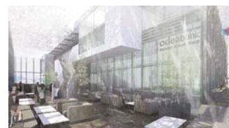
Odeabank Headquarters, Istanbul Fit-out project.