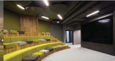
Avolon Phase 2 Within 3 years of completing Phase 1, MOLA were asked to address a doubling of Avolon's staff numbers in Phase 2.