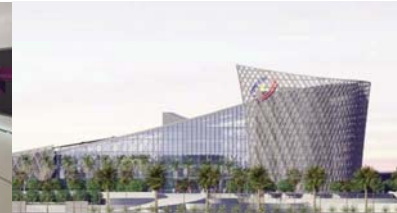
Saudi Civil Aviation Holding Company, Riyadh. GMW Architects has designed the new HQ for the General Authority for Civil Aviation in KSA.