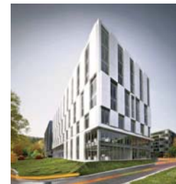
Office Complex, Kraków partly completed, 40,000 GLA.