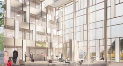
KHV7, Copenhagen New multi-flex office headquarter for MTH in Gladsaxe, Copenhagen. Area: 12,500m 2 .