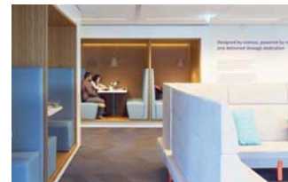
A bio-technical business, Amsterdam Design of an appropriate and inspiring layout for the new offices of a bio-technical business. A work environment that expresses the sustainable, innovative character of this listed company. 1,050m 2 , delivered in 2014.