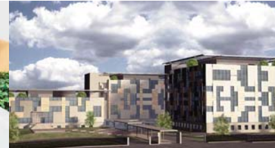
Caboto Office Complex, Corsico Total refurbishment of 12,200m 2 of office interiors and services, restyling of facades, redesign of parking and green spaces.