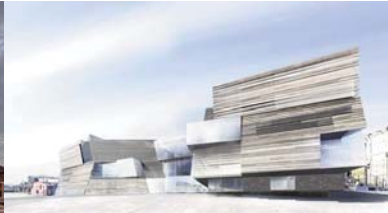
Guggenheim Museum, Helsinki, Finland competition.