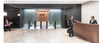
67 Lombard Street, London provides high quality modern offices for the financial services sector. The building was completed in the summer of 2014 for Viridis Real Estate Services and has ten levels of office space

5-6 St. James's Square, London Completed in 2014, this redevelopment provides commercial offices, residential units and a small art gallery. No. 5, a Listed building, has been refurbished, while the remainder of the project is contemporary new build.