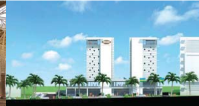
Soras Towers, Kigali, Rwanda Mixed-used building under construction.