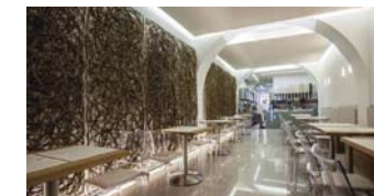
Vegetarian restaurant, Cagliari All natural and local materials and finishes have a strong connection with to a food concept based on rigor, simplicity and naturalness in the choice of ingredients.