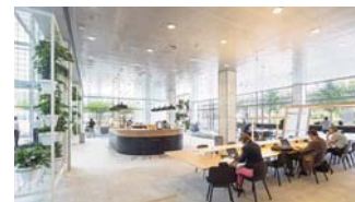
Haagse Poort/CBRE, Den Haag Development of a vision for the ground floor and conference centres in the Haagse Poort/CBRE. The solutions contribute to a successful transformation from a single tenant to a multi-tenanted situation. 1,700m 2 , delivered in 2014.