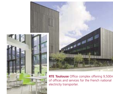
RTE Toulouse Office complex offering 9,500m 2 of offices and services for the French national electricity transporter.