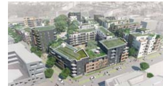
New sustainable district, Tivoli, Brussels (in association – Adriana a.m.) Project winner for Citydev. Brussels. 400 apartments, 2 nurseries, commercial spaces and public park.