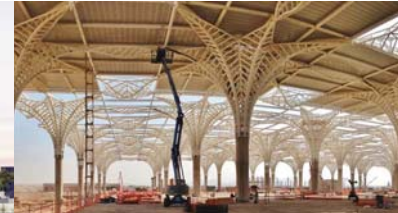
Prince Mohammed Bin Abdulaziz International Airport, Medina Progress on site.