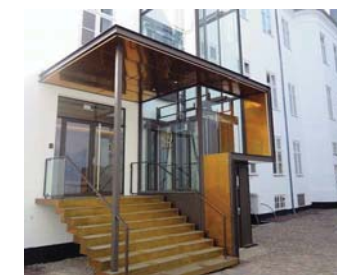
Bredgade 30, Copenhagen. Refurbishment of a historic building in the center of Copenhagen. The building houses exclusive office spaces with shared front desk, espresso bar, restaurant, etc. Area: 7,500m 2 .