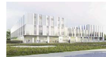
CEA Saclay A 9,700m 2 building of laboratories, clean rooms and offices for the climate department of the CEA.