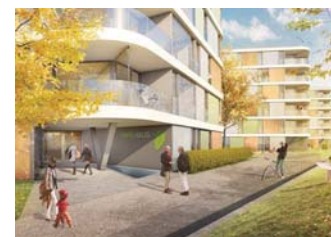
Park House, Berlin Urban living apartments and parking, 10,869m², 139 apartments, 98 parking lots. Competition design 2014.