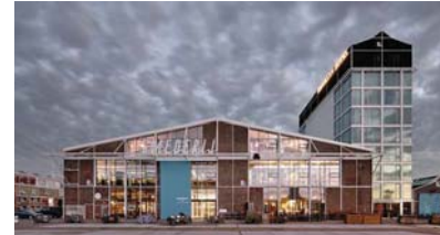
Greenpeace, Amsterdam Sustainability and recycling were the key drivers for renovated former industrial forge. 2,500m 2 , delivered in 2014.