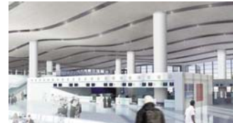
Terminal 5, King Khaled International Airport, Riyadh Departures level check-in hall.