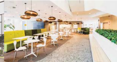
Ernst & Young Finland A new office HQ for 450 people. GI designed all fit-out works, 5,500m 2 , LEED Gold.