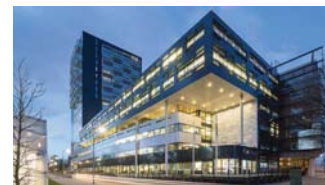
Vopak, Rotterdam The transformation of the HQ of VOPAK into a bustling meeting centre and an inspiring open workplace. 3,000m 2 , delivered in 2014.