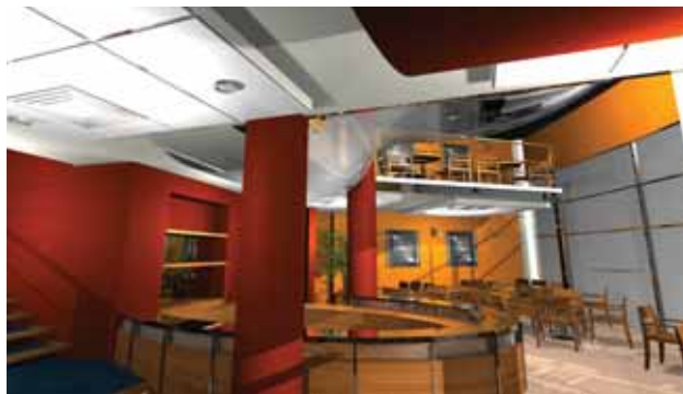
Cafe, Galeria Kazimierz, Kraków