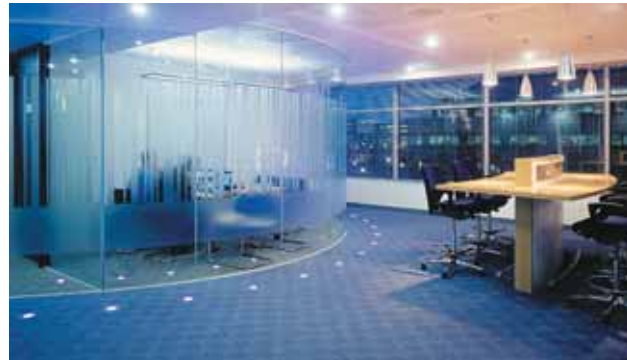
KPMG, Milton, Keynes