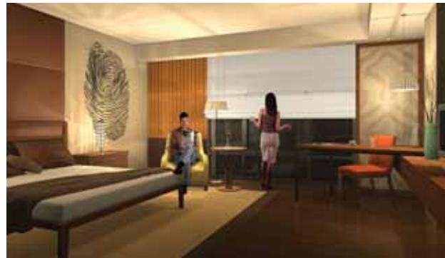
Cerruti Hotel, Istanbul