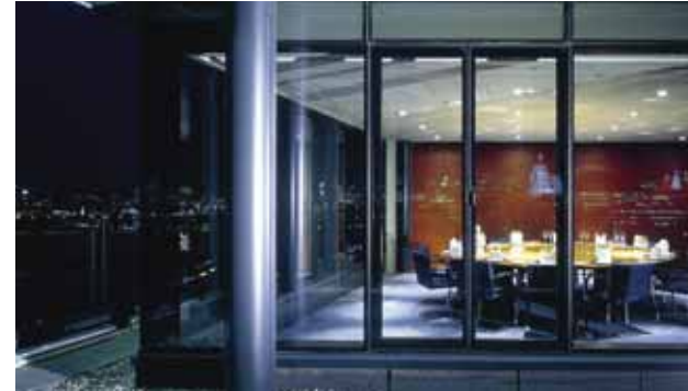
British American Tobacco Headquarters, London