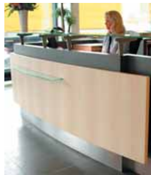
Group 4 Falck, Copenhagen