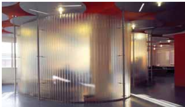
f-zien Company, Athens