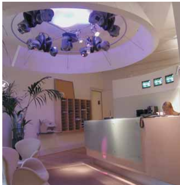
EMI Headquarters, Copenhagen