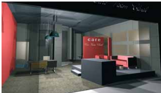
Care Vision Clinic, Kraków