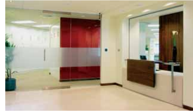
Mellon Bank, Dublin