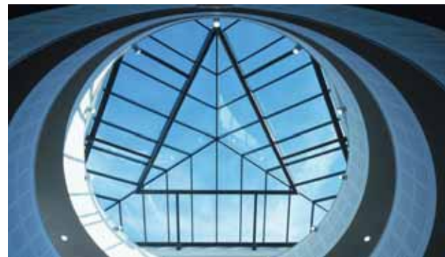
C.E.I. Construct S.A., Brussels