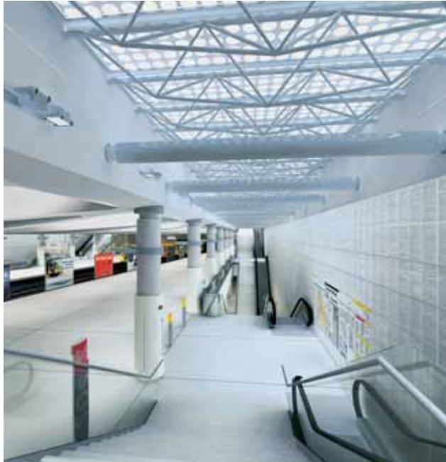
Underground Station, Berlin City Hall