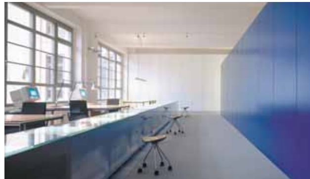
Vegla/Saint-Grobian Glass , Berlin

Collignonfischötter Architekten ■ Berlin