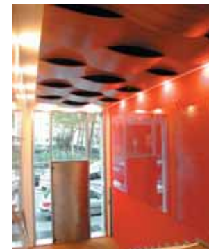
Toffoletto & Associati, Milano