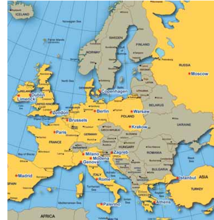
EAA member locations throughout Europe

Internationally recognized for its architectural achievements, the EAA's work in interior architecture and design is equally impressive and further strengthened through the recent addition of GMW-IA Interior Architects, representing an association between GMW Architects and IA Interior Architects, a United States firm. IA Interior Architects is the first and largest global architectural firm dedicated exclusively to interior architecture and ranks as one of the foremost firms world-wide in corporate and financial institution design. With 14 offices, 12 of which are in the US, IA has provided interior architecture and design services to corporate and multi-national clients for over twenty years in the US, Asia, Europe and South America.