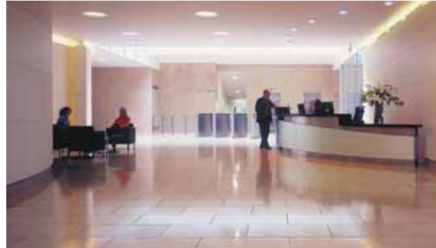
Ansbacher Bank Headquarters, London