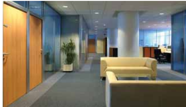
Thales University, Paris