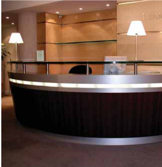
Lehman Brothers, Paris