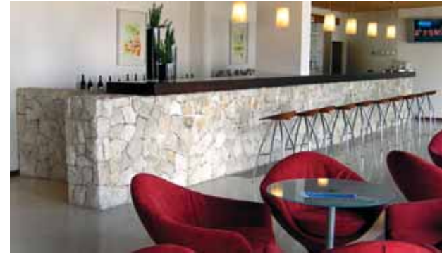
Hotel Ilirija, Biograd, Croatia