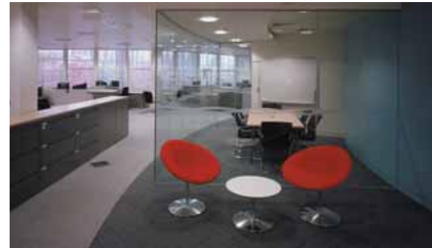
British Gas Headquarters, London