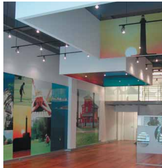
Polaris World, Amsterdam