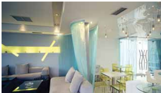
talk&drink café-bar, Athens