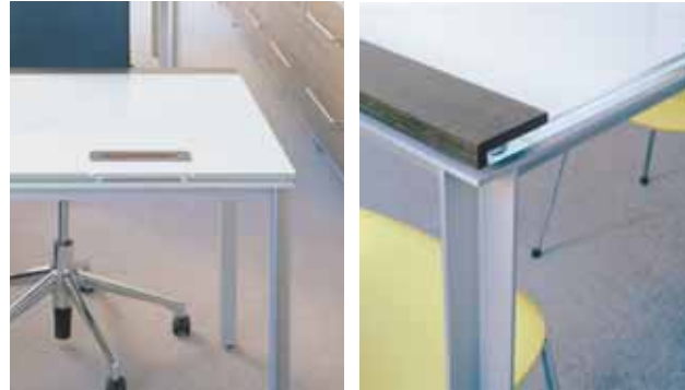
Vegla/Saint-Grobian Glass - Custom Table/Detail, Berlin