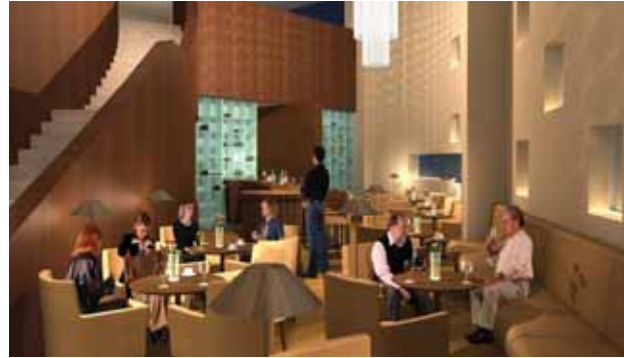
Cerruti Hotel, Istanbul