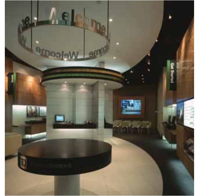
TD Waterhouse, London