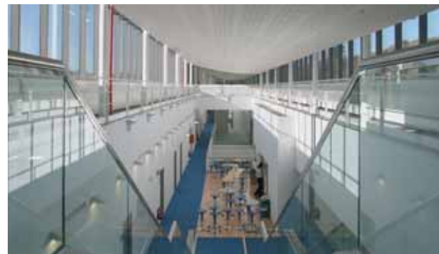
DuPont, Tamón Valley, Asturias