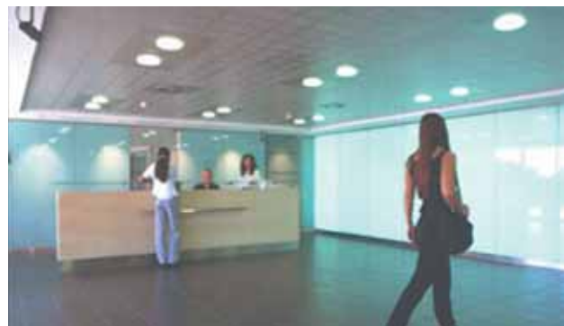
Danske Bank, Copenhagen