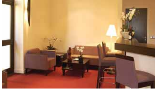
Thales University, Paris