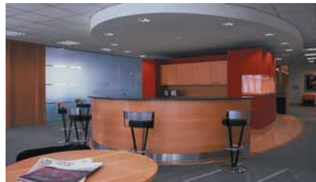
Bea Systems, Parque Norte, Madrid