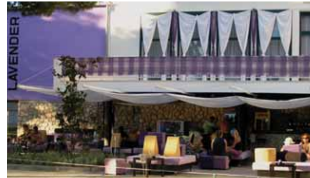
Lavender, Biograd, Croatia