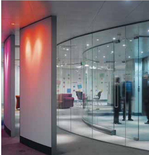
Imagine & Evolution, London