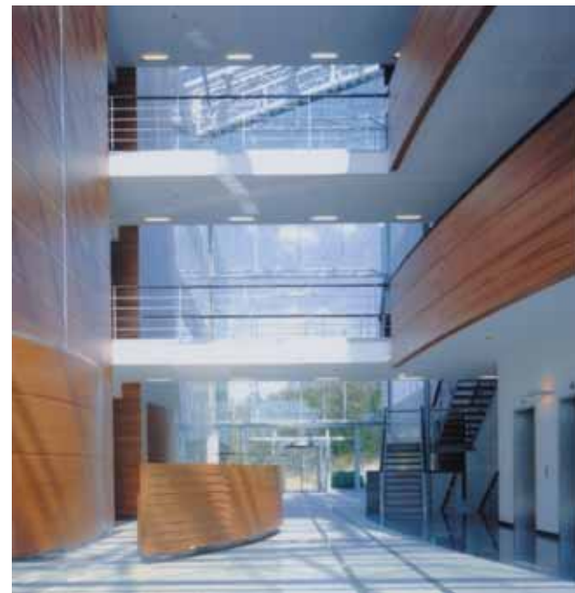
IMMO 167, Waterloo