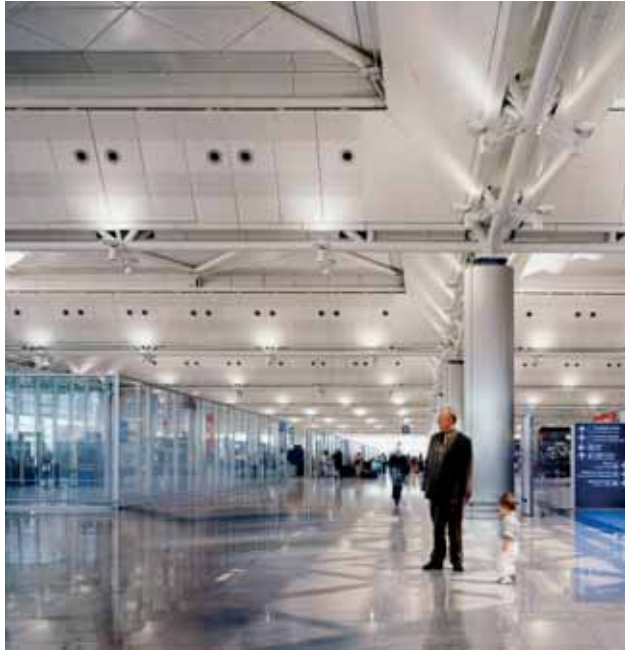
Atatürk Airport, International Terminal, Istanbul