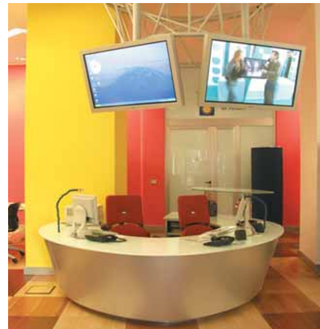
Comune di Milano, Milano