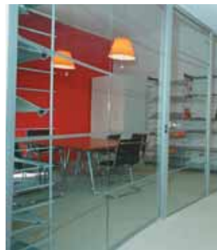
Steer Davies Gleave, Bologna