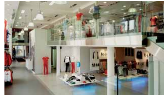
Adidas Olymp, Moscow