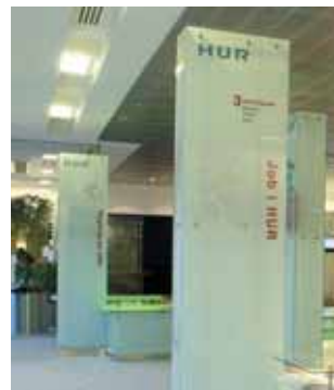
HUR 1 IA, Copenhagen