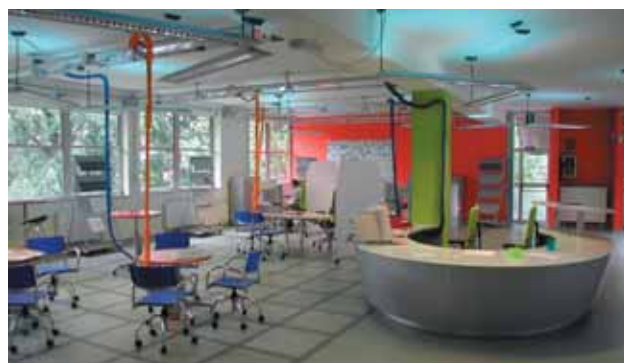
Provincia di Milano, Milano