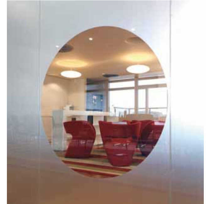
Microsoft European Operations Centre, Dublin