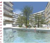
Residential and Commercial Development 'Precious Park', Bucharest, Romania Shielded from the road between city and airport by an office building and a flagship car showroom lies this luxury residential development. The masterplan balances a high density with an optimum of orientation, sunlight and focus to the adjacent forest. Design in progress.