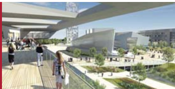
Cromcastle, Dublin A phased development incorporating retail and offices, plus a medical centre, 1,403 mixed residential units, civic and cultural facilities.