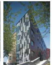
Broadstone Hall, Dublin Innovatively clad city-centre accommodation for 96 students on four levels. Set on a steeply-sloping landscaped site, the building connects an upper-level park to the lower level street.