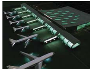
Skopje Alexander the Great Airport, Macedonia A new 40,000m 2 international terminal and ancillary buildings to handle four million passengers a year for developer/operator TAV.