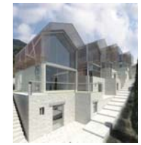
Summer village Lefkada, Greece In a design based on the dense urbanism of Ionian coastal villages, this new 20-house village blends local vernacular and contemporary design to create a scheme reminiscent of its historical precedents. Local materials – stone, timber and rendered plaster – anchor the scheme in the locality. Clever use of topography gives each house a unique view to the old town and the sea beyond.