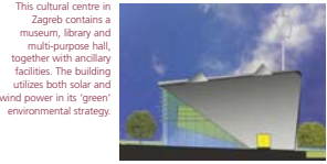
This cultural centre in Zagreb contains a museum, library and multi-purpose hall, together with ancillary facilities. The building utilizes both solar and wind power in its 'green' environmental strategy.