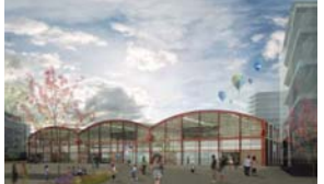
Market Hall, Frederiksberg Refurbishment of historic market buildings to provide 2,500m 2 of retail accommodation in Copenhagen's South Harbour area. The client is Nordia.