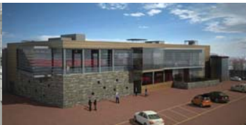
Albin cotton mills, Bergamo A new building connected to the spinery, housing offices, training and convention rooms and a unique fabrics' library.