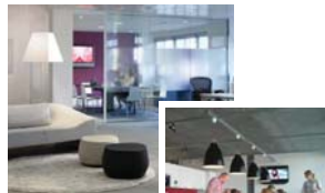
Discovery Networks Europe An series of fit outs across Europe providing unique offices that combine consistent services and infrastructure with designs that reflect local business culture.