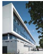
UCD Health Sciences Complex, Dublin Master plan and phased development of new state-of-the-art teaching facilities and clinical skills labs designed to simulate a real hospital working environment.