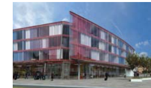
Shopping Mall and Hotel, Jaroslaw A commercial centre in the city centre offering 50,000m 2 of retail and a high class hotel.