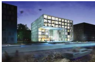
Office Building, Stralauer Allee - Mediaspree, Berlin This scheme for a 7-floor office building creates an architectural landmark as a logical design solution for a difficult site. The cut-out cube provides efficient, flexible office space together with a spectacular covered terrace overlooking the River Spree. The building can be used as a headquarter or let up to four tenants per floor. 10,100m 2 Gross floor area. Design in progress.