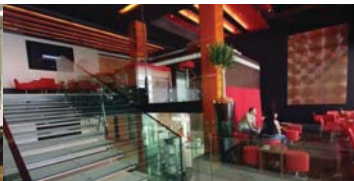
Callego in Zadar Croatia.