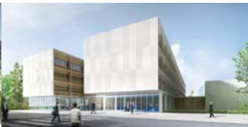
Palaiseau A 17,000m 2 building providing offices laboratories and cleanrooms for an industrial firm in the heart of the European scientipole of Sacy.