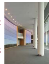
Les Petits Riens This is our winning entry to a competition held in 2008 for the design of a new warehouse in Brussels. It will be used to sort used clothes for recycling.