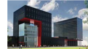
Sukcesja mixed-use development, Lodz A mixed-use complex of office buildings, hotel and shopping gallery totalling over 97,500m 2 where an existing historical factory was incorporated into contemporary context.