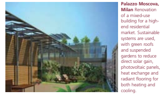
Palazzo Moscovia, Milan Renovation of a mixed-use building for a high-end residential market. Sustainable systems are used, with green roofs and suspended gardens to reduce direct solar gain, photovoltaic panels, heat exchange and radiant flooring for both heating and cooling.