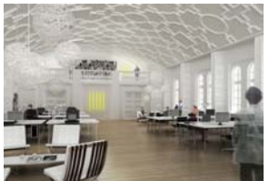
MIMO Invest An office conversion of 5,020m 2 in Rosenborg, Copenhagen to be completed in 2009.