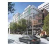
Cork School of Music, Cork The first educational PPP development undertaken by the Irish Government, the Cork School of Music provides specialist facilities in a world-class environment for music and performance education.