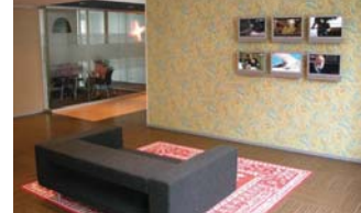
Discovery Channel, Milan 'An office that doesn't look like an office' - an inspiring place to be cool, stylish, highly functional, and also a glamorous 'destination' that becomes a conversation piece for visitors, with designer furniture and lamps, rugs, wallpaper and a living screen of plants.