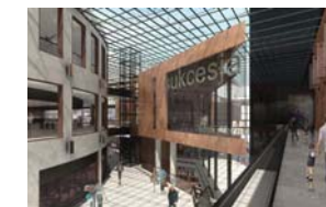
Mixed use development Interior design for the public spaces in a retail mall.