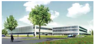
Market Hall, Frederiksberg Refurbishment of historic market buildings to provide 2,500m 2 of retail accommodation in Copenhagen's South Harbour area. The client is Nordia.