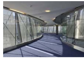
European Parliament Building, Brussels The final phase of the European Parliament Building provides 77,000m 2 over 13 levels. Facilities include offices, large conference rooms with cabins for simultaneous translation, radio and TV studios, plus social and cultural spaces. A large circular footbridge spans the mall between the buildings and links all the parliament buildings. Beneath this mall are railway lines and a station and the project provides a new entrance to the station.