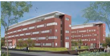
TDC A headquarters building for Sjaelsoe Gruppen on Tegholm, Copenhagen. Stage 1 of 9,279m 2 to be completed in 2009.