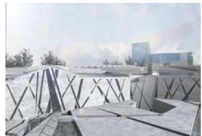
Mercado de la fruta, Madrid