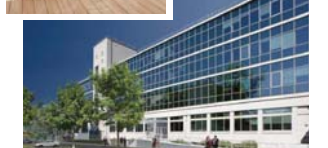
Elancourt A 32,700m 2 industrial building for the French aviation firm EADS in western Paris. This building includes offices, laboratories and clean room and will be delivered in June 2009.