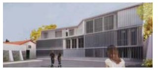
Clamart Refurbishment and extension of the fire station in South Paris. To be completed in June 2010.