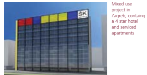
Mixed use project in Zagreb, containing a 4 star hotel and serviced apartments