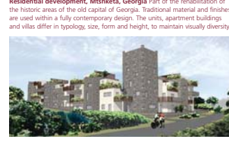
Residential development, Mtskheta, Georgia Part of the rehabilitation of the historic areas of the old capital of Georgia. Traditional material and finishes are used within a fully contemporary design. The units, apartment buildings and villas differ in typology, size, form and height, to maintain visually diversity.