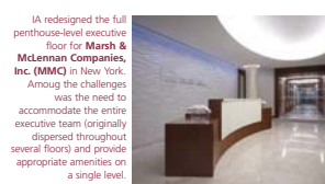
IA redesigned the full penthouse-level executive floor for Marsh & McLennan Companies, Inc. (MMC) in New York. Among the challenges was the need to accommodate the entire executive team (originally dispersed throughout several floors) and provide appropriate amenities on a single level.