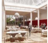
Malakoff Full refurbishment of a 13,000m 2 building for the French group ACCOR in the south of Paris. Completion planned for the first quarter of 2009.