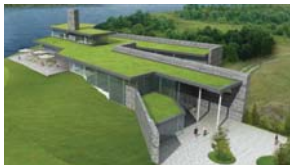
Clubhouse Lake Lagan Golf course clubhouse at Trarød, Sweden for EuroPeak Investment